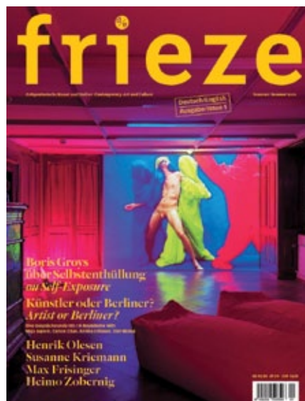
《frieze d/e》 创刊号封面 The cover of the first frieze d/e

5月19日, Frieze终于将酝酿多时的野心昭示天下:在纽约和伦敦分别举办两场新的博览会。其中,“Frieze New York”自然是在纽约的大盘里分一杯羹,将于明年5月登陆曼哈顿的兰德岛公园;而“Frieze Masters”关注的则是二十一世纪前的“艺术大师”,会在明年10月与博览会主场同台亮相。此外, Frieze出版社的全新杂志《frieze d/e》4月11日也在“柏林画廊周末”活动上正式发布,这是《Frieze》杂志创刊20年以来推出的首本新刊物,以德语和英语共同呈现,按季度每三月发行一期。