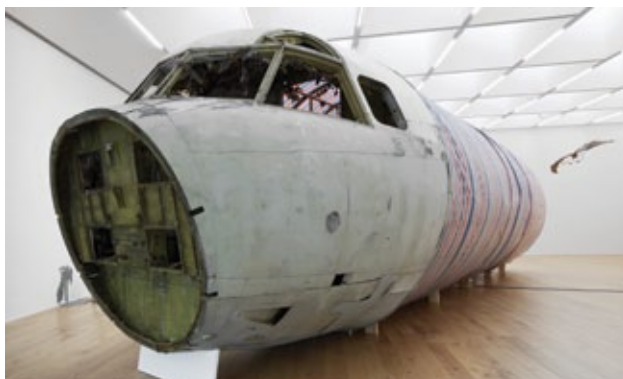
Nottingham Contemporary