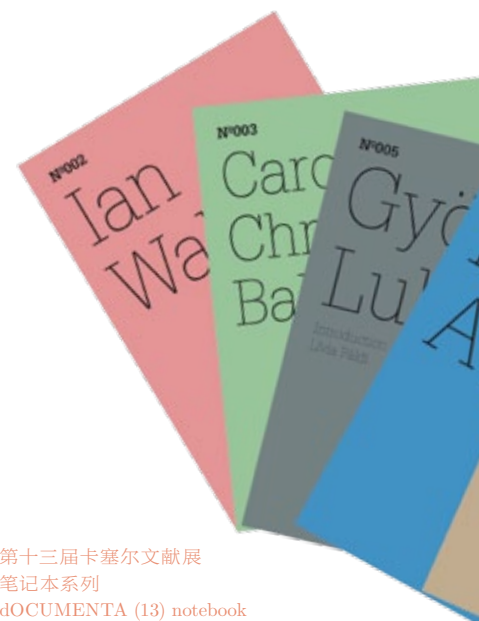
第十三届卡塞尔文献展 笔记本系列 dOCUMENTA (13) notebook series "100 Notes - 100 Thoughts / 100 Notizen - 100 Gedanken," Copyright: dOCUMENTA (13).

English “Zeitschrift,” called frieze d/e , at Berlin Gallery Weekend. Though the focus is on Germany, Austria and Switzerland, its aim is to “capture a local dialogue with a worldly resonance.”