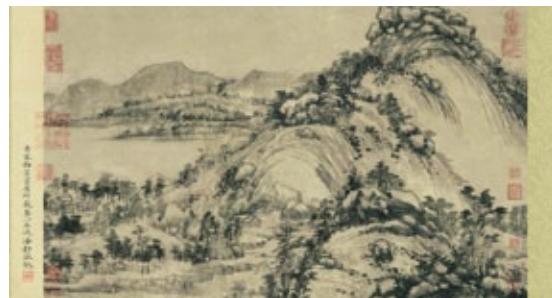
Huang Gongwang Dwelling in the Fuchun Mountains (first piece) Yuan Dynasty. Zhejiang Provincial Museum